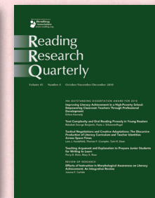
Scholarship in literacy